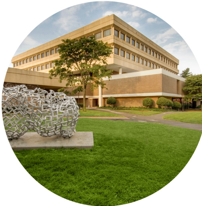
Grace E. Harris Hall Monroe Park Campus