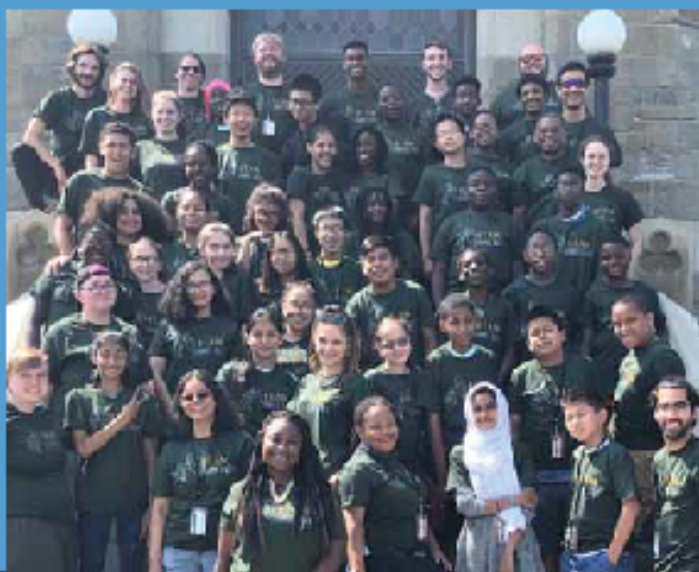
All students and staff at Union College in Summer 2019

Bridge to Enter Advanced Mathematics is a free program for students from low-income and historically marginalized communities who show exceptional potential in mathematics.