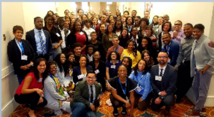
2019 Workshop Attendees

Register here: https://www.enar.org/meetings/FosteringDiversity/