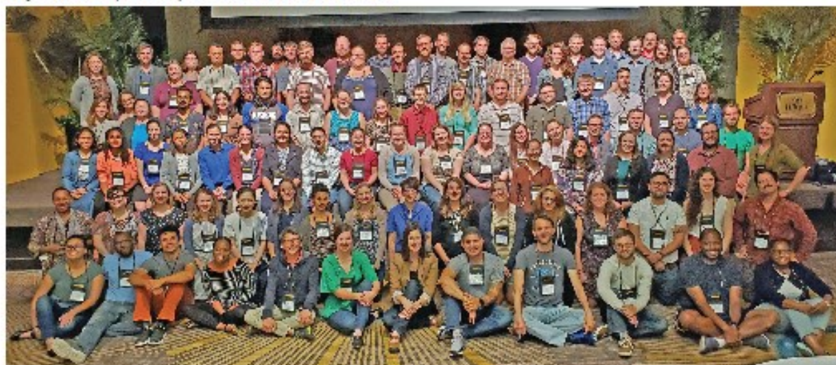
Project NExTers (Silver '19) at MAA MathFest in Cincinnati.

Application deadline: April 15, 2021 projectnext.maa.org • projectnext@maa.org