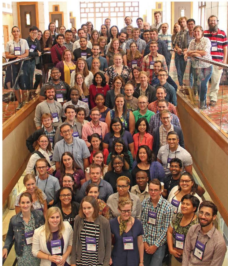
Project NExTers at MAA MathFest in Denver.

MAA Project NExT welcomes and encourages applications from new and recent PhDs in postdoctoral, tenure-track, and visiting positions. We particularly encourage applicants from underrepresented groups, including women and minorities. Applications for the 2019 cohort of MAA Project NExT Fellows are due on April 15, 2019 and can be found at projectnext.maa.org .