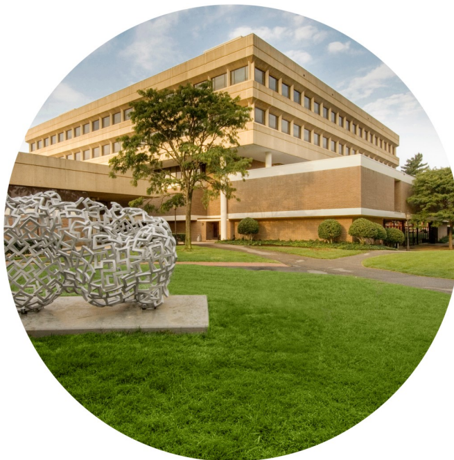
Grace E. Harris Hall Monroe Park Campus