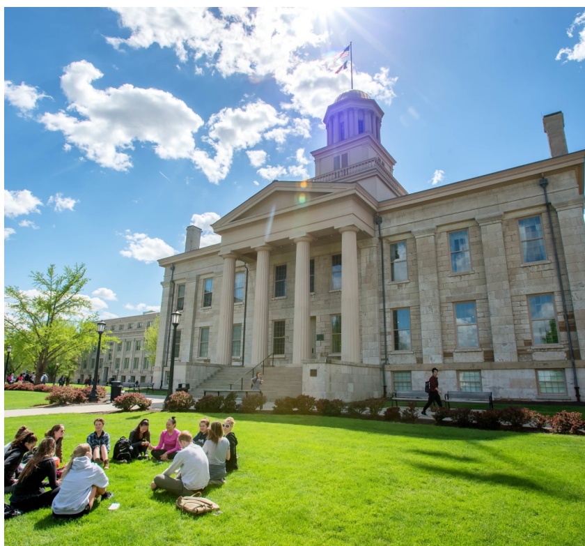
Students in front of the Old Capitol Building in the heart of the campus.