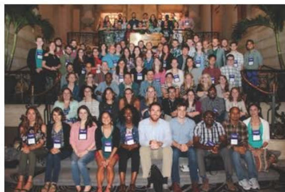
2017 MAA Project NExT cohort

MAA Project NExT is a year-long professional development program of the Mathematical Association of America (MAA) for new or recent Ph.D.s in the mathematical sciences. The program is designed to connect new faculty with master teachers and leaders in the mathematics community and address the three main aspects of an academic career: teaching, research, and service. MAA Project NExT Fellows join an active community of faculty who have gone on to become award-winning teachers, innovators on their campuses, active members of the MAA, and leaders in the profession.