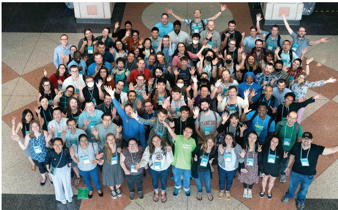
Project NExTers (Green '23) at MAA MathFest in Tampa.

Application deadline: April 15, 2024 projectnext.maa.org • projectnext@maa.org